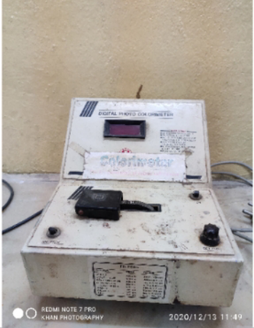
Digital Photo Colorimeter