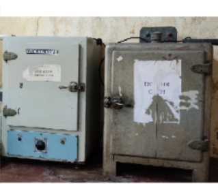
Incubator & Hot air oven