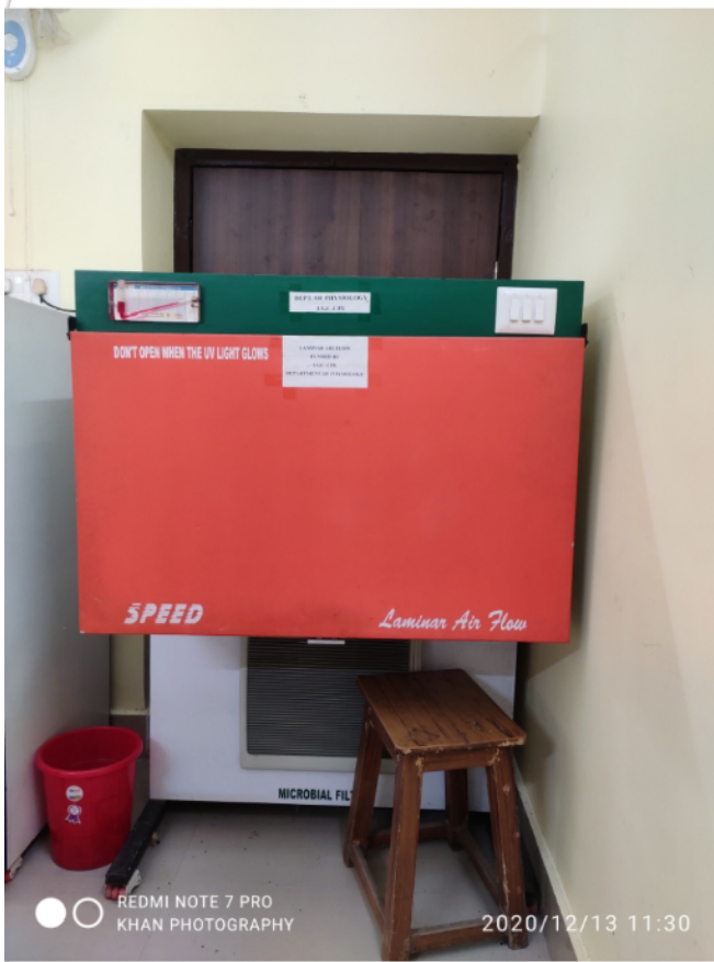
Laminar Air Flow