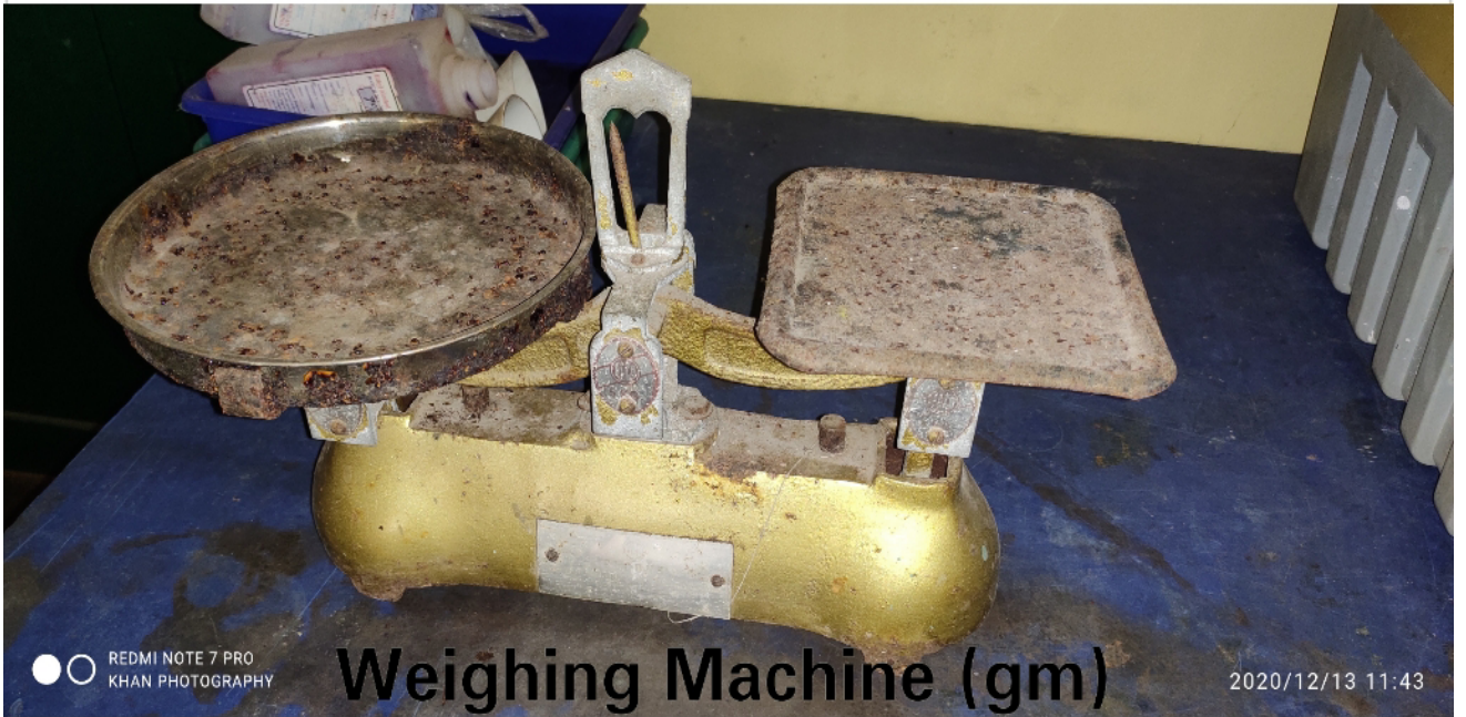
Weighing Machine (gm)