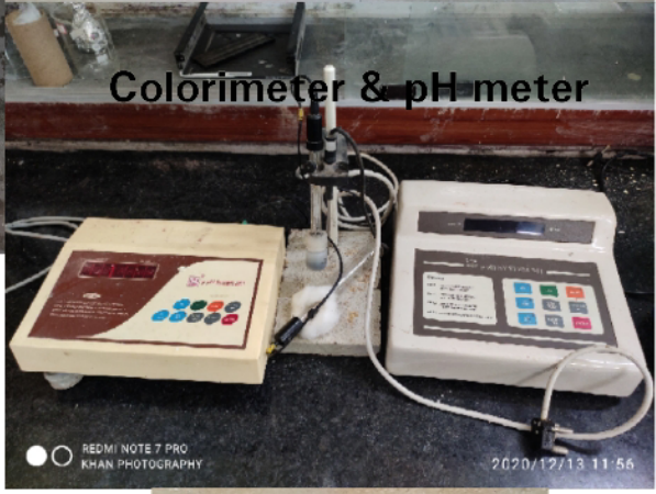
Colorimeter & pH meter