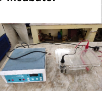
Gel Electrophoresis Apparatus