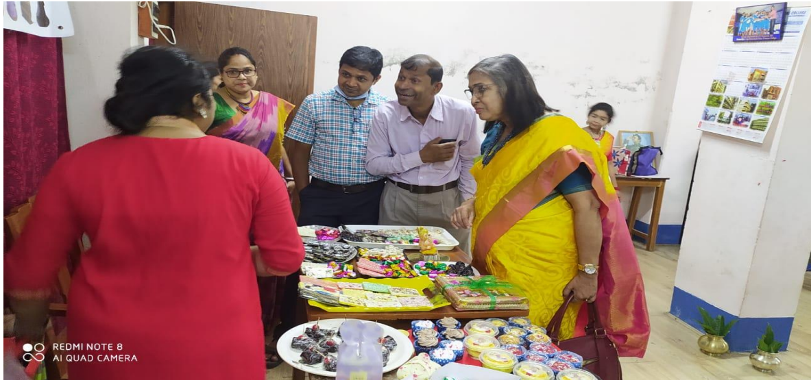
Fig: Principal madam and other faculty members visited the stall offered by alumni members.