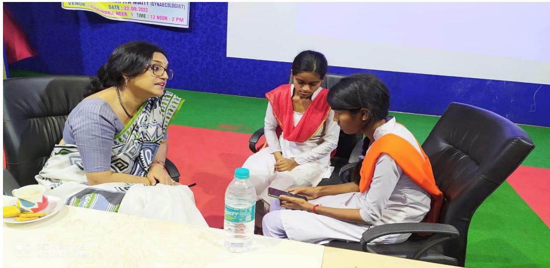
Fig: Doctor attended the students to discuss about the PCOS.