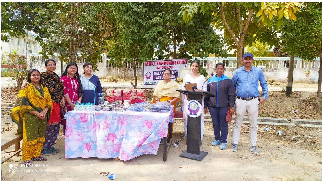
Fig: Sports day arranged by Balaka for the children of college cleaning staffs.