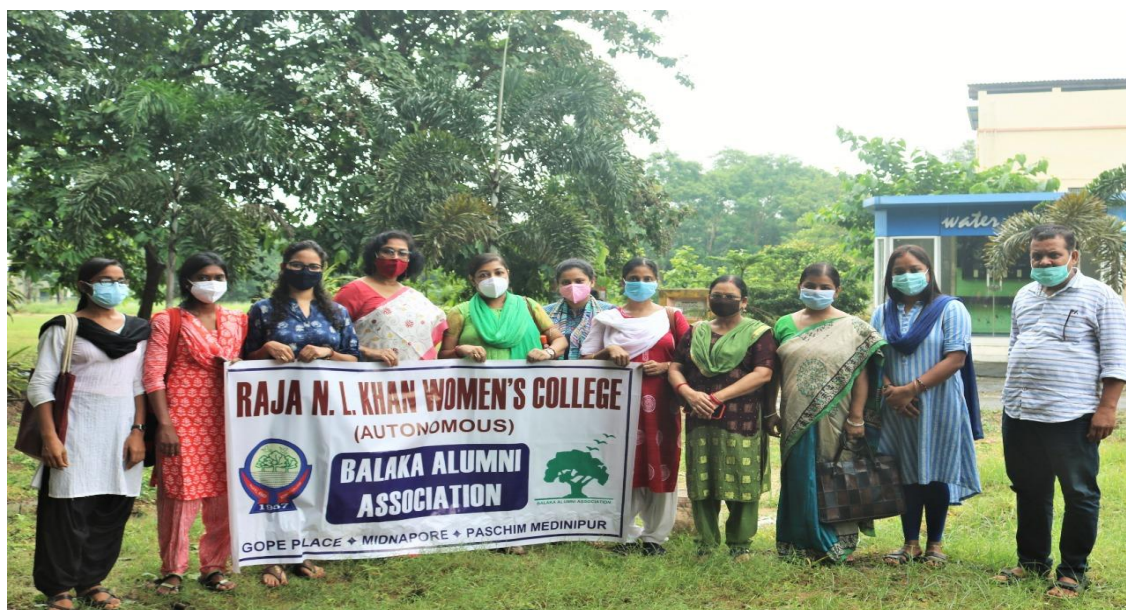
Fig: Tree plantation programme by Balaka