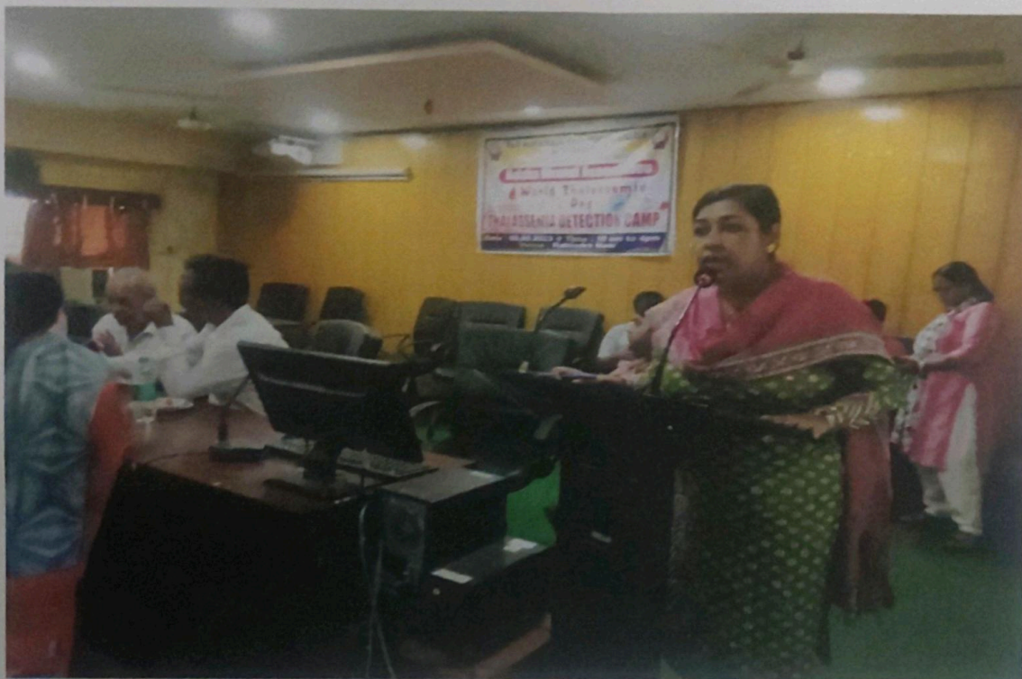
Fig: World Thalassaemia Day was observed by Balaka Alumni Association.