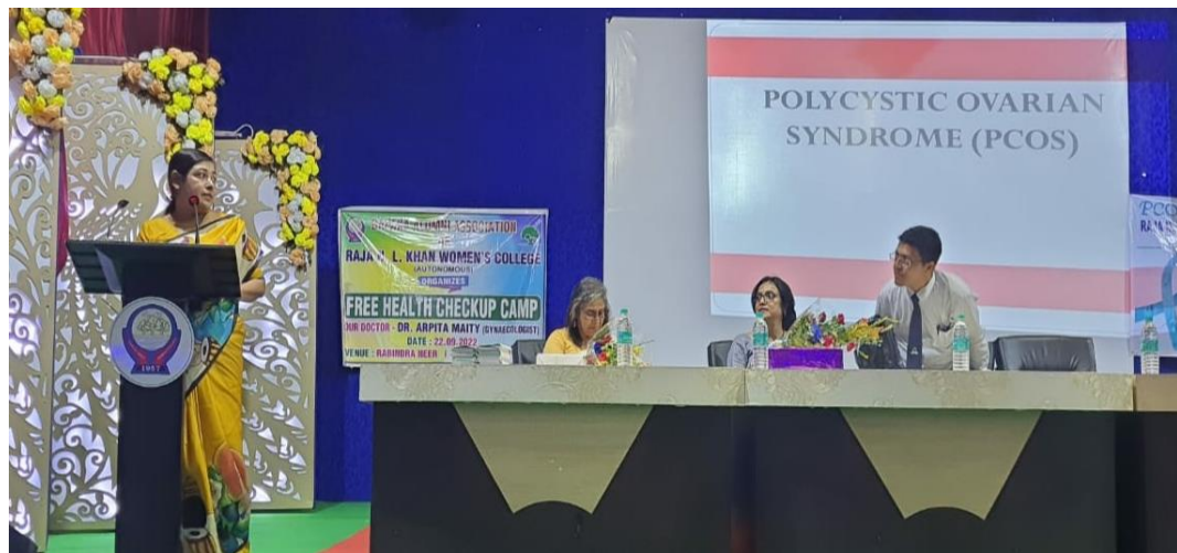
Fig: Inaugural session of PCOS Advocacy.