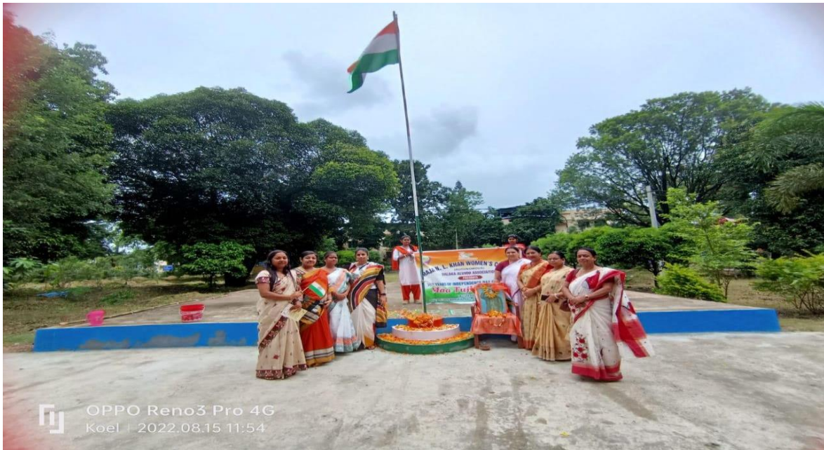
Fig: Flag hoisting on the occasion of Independence Day by Balaka