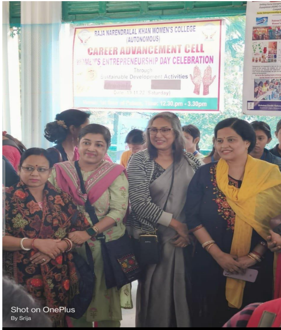
Fig: Entrepreneurship programme by Balaka.