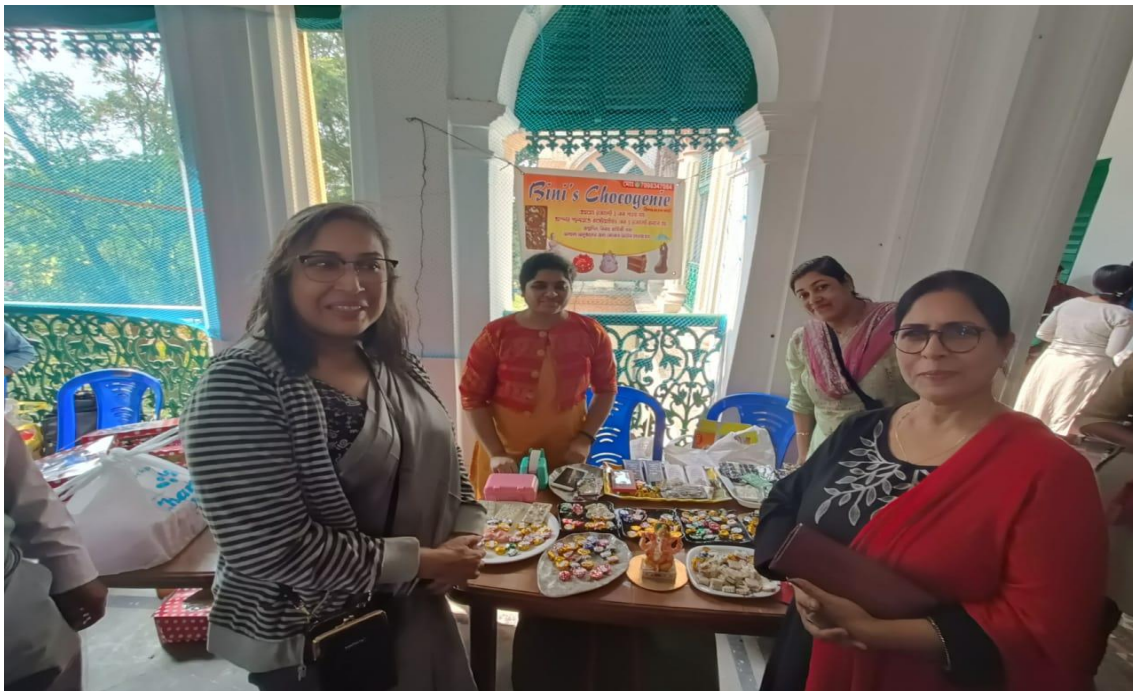
Fig: Stalls visited by the Principal and other faculty members.