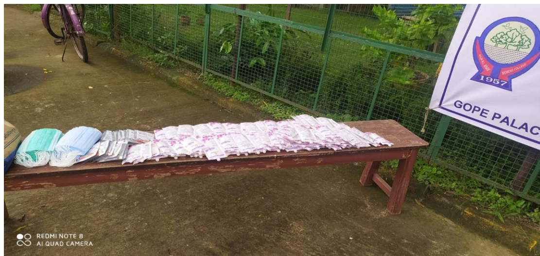
Fig. Balaka distributed Mask and Sanitizers.