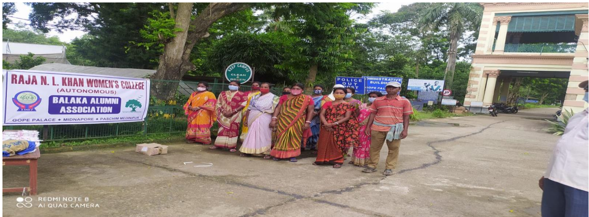
Fig Field Staff received mask and sanitizers from Balaka.