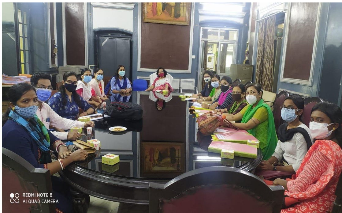
Fig: Annual General Meeting.