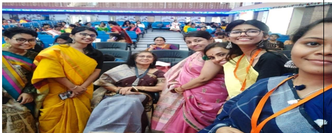
Fig: Reunion Programme 2022