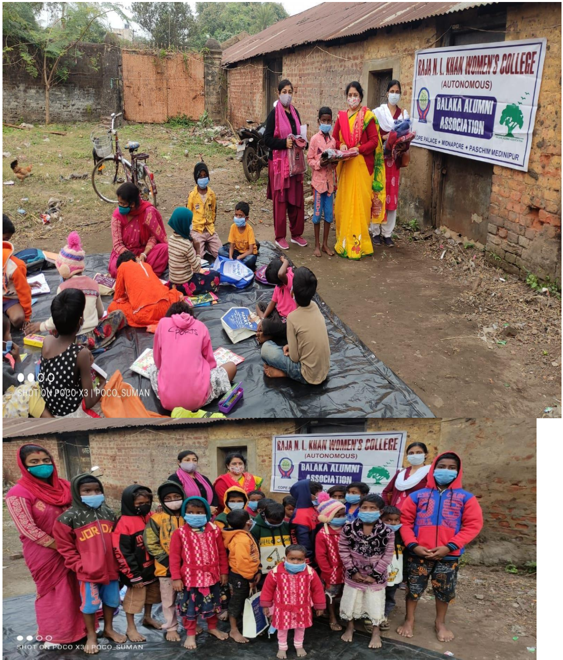
Fig: Winter Garments distribution to the street children by Balaka.