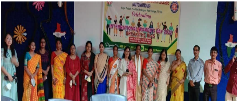
Fig: International Women’s Day 2022 organized by Balaka.