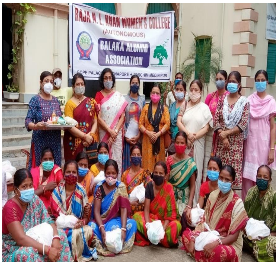
Fig: Dry foodstuff distribution by Balaka.