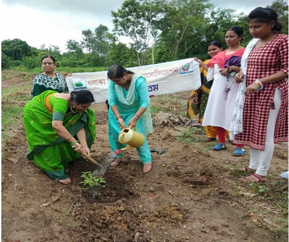
Fig: Tree Plantation Programme organized by Balaka.