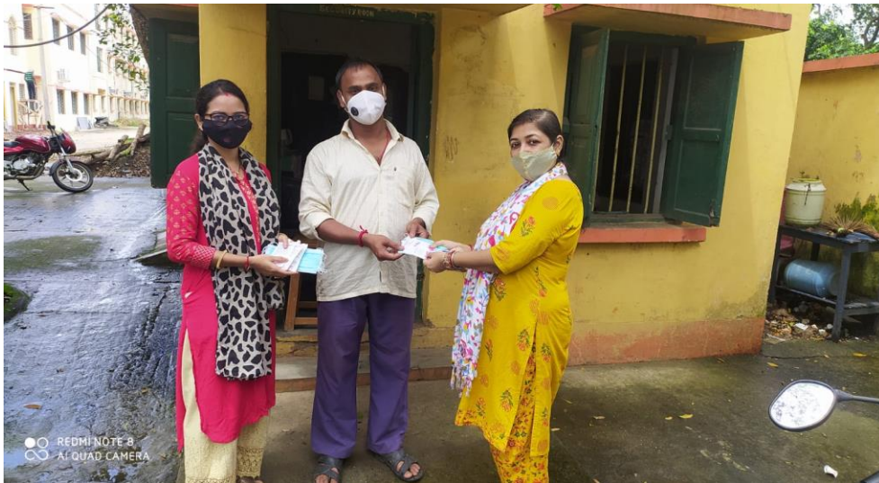
Fig: Distribution of mask and sanitizer to gate keepers.