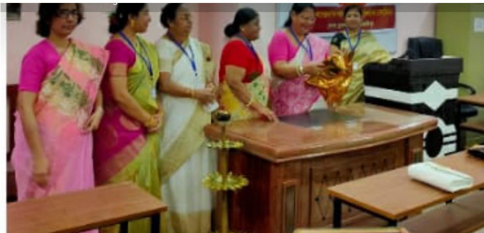
Fig: Glimpses of 19 th Reunion Ceremony.