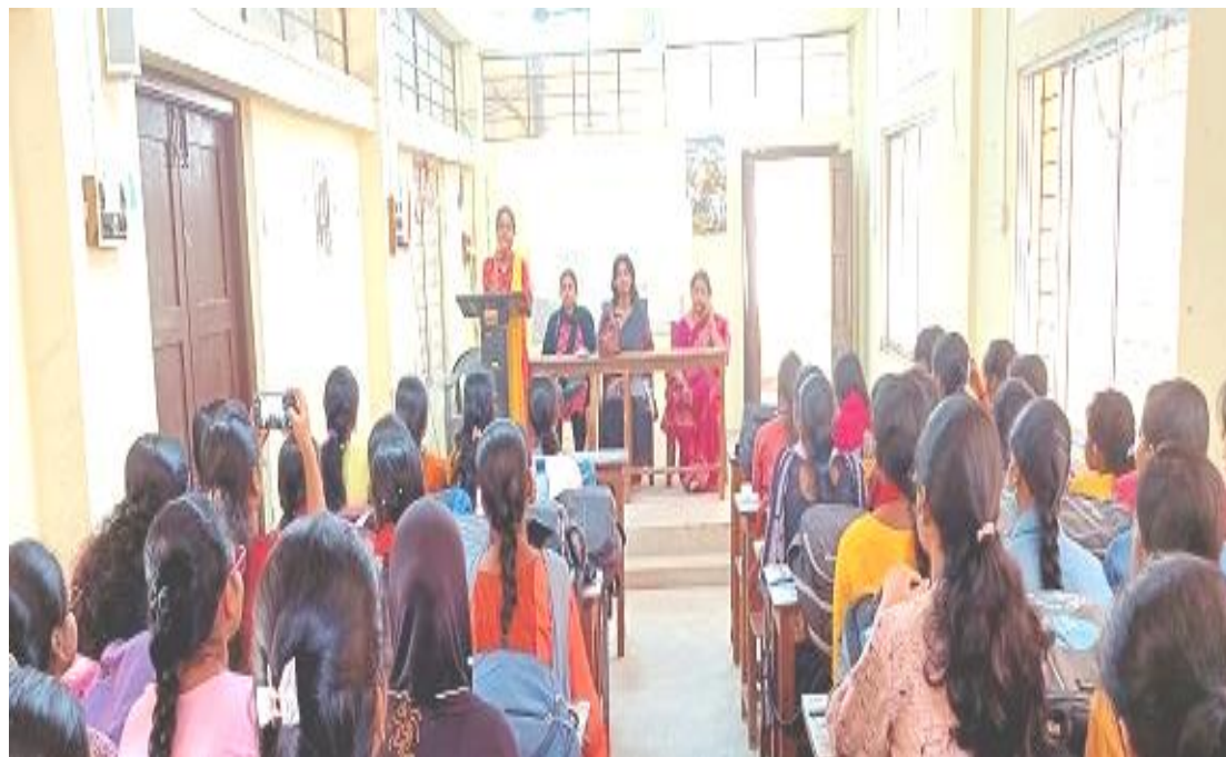
Fig: Annual General Meeting of Balaka, 2020.