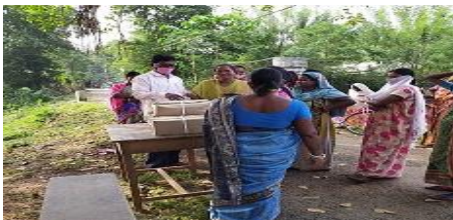
Fig: Villagers of Muradanga received mask and sanitizer from Balaka.