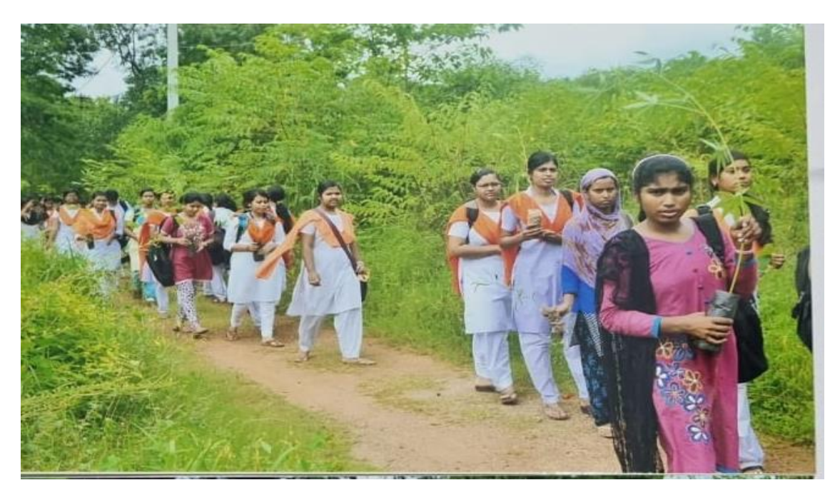
Fig: Students on their way to plant tree saplings inside the College campus.